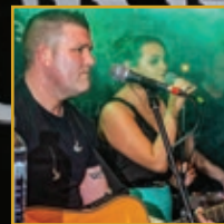
Fri 22nd Dec Atmosphere Band