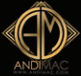
TABLE BOOKINGS Tel: 028 7938 7066

NEW YEARS EVE TWO FANTASTIC ACTS UNDER ONE ROOF!