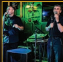
Christmas Night Legacy Band