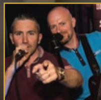
Sat 9th Dec Bleed'N'Cowboys