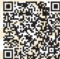
TABLE BOOKINGS ONLINE OR BY PHONE Tel: 028 7938 7066