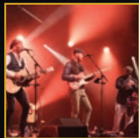
Sat 23rd Dec Pure Blarney