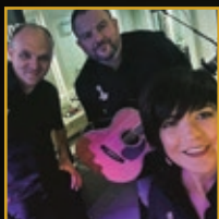
Sat 16th Dec The Convicts Band