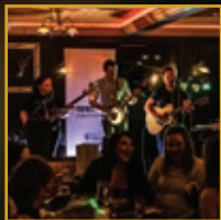
Boxing Night Take it to The Limit